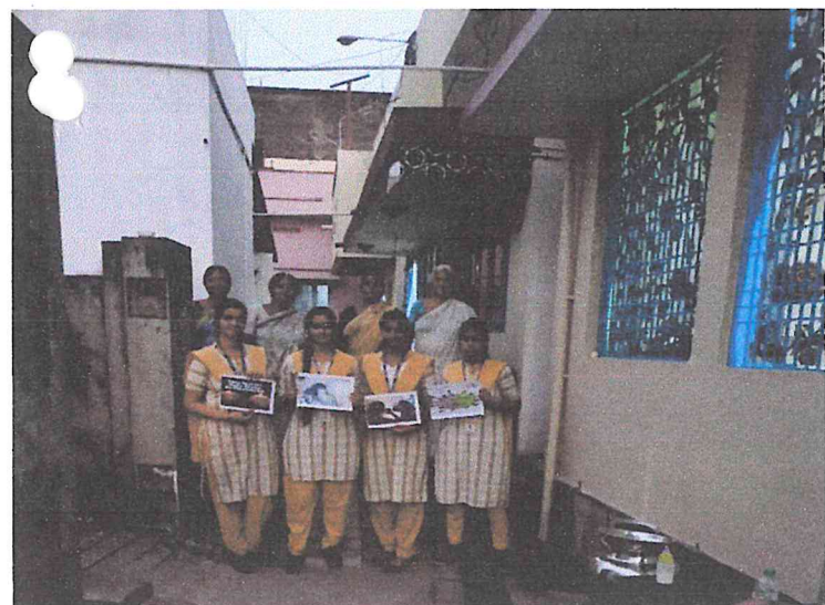
Fig: Educating the nearby people regarding the ill effects of Firecrackers at the times of Diwali.