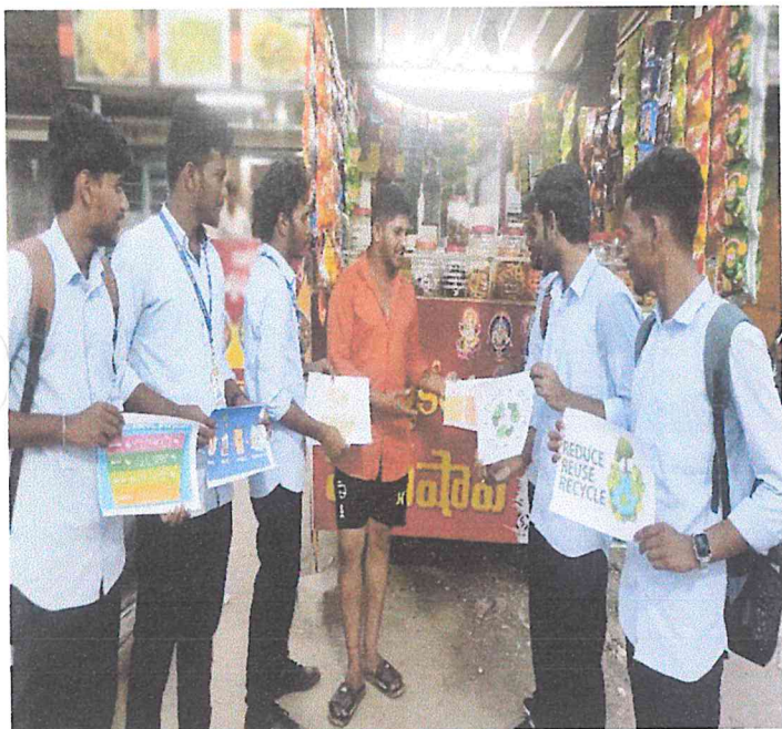
Fig-3 Explaining the concepts of RRR to the people at shops