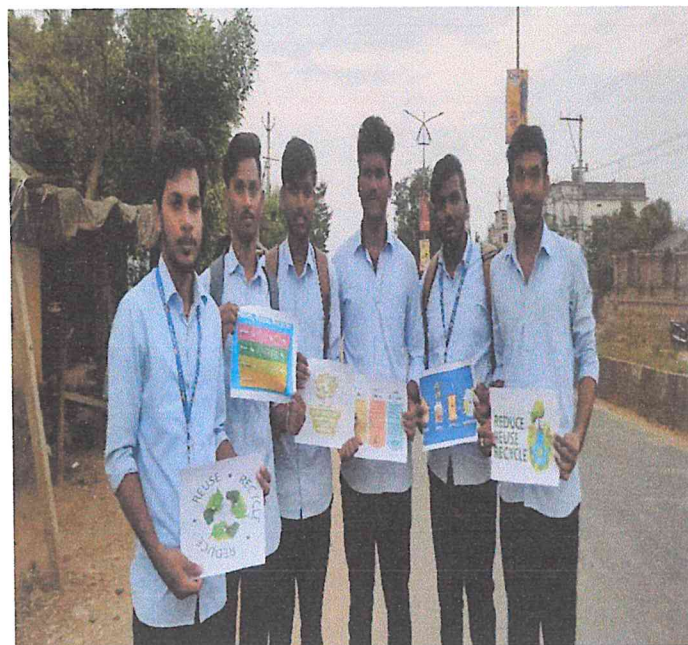
Fig-4; Date: 09-09-2021, Place: Kotapadu