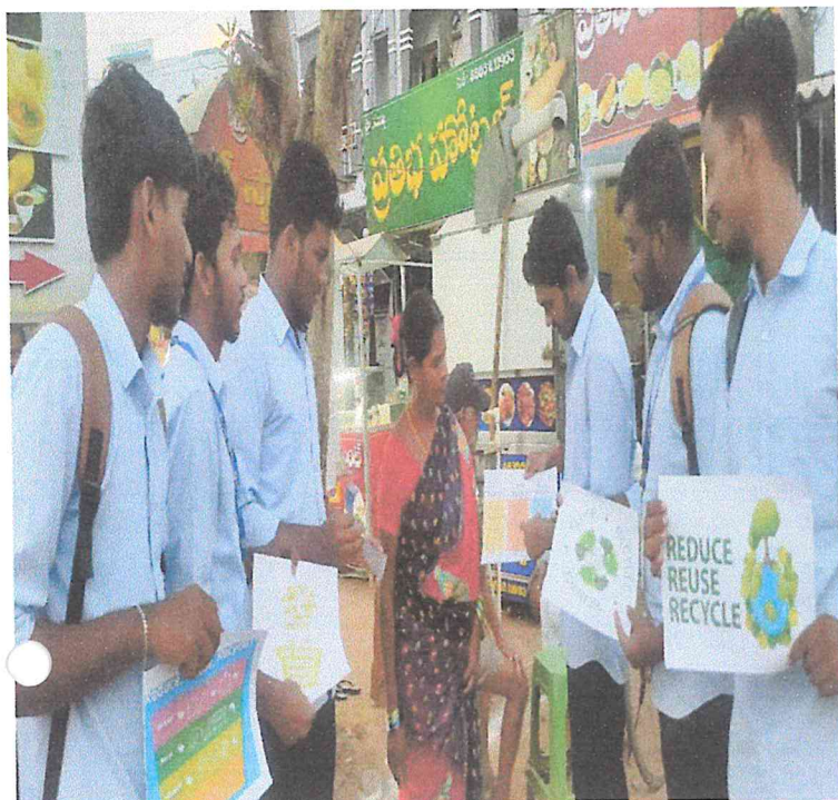
Fig-1 Explaining the concepts of RRR to the people at shops