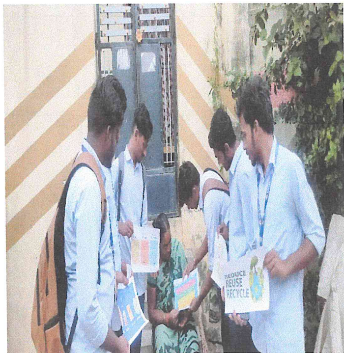
Fig-2 Explaining the concepts of RRR to the people in household